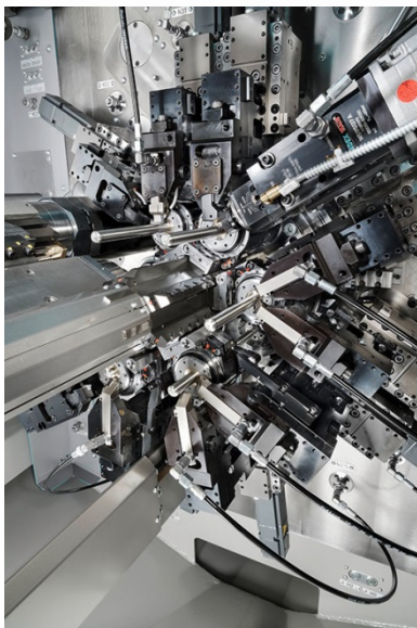
Fig. 2: The typical INDEX arrangement of tool carriers in the working area allows more than one tool to be used on each spindle.